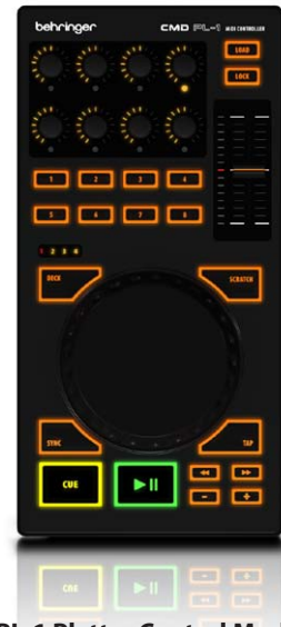
CMD PL-1 Platter Control Module

And remember that at its heart, the LC-1 is an array of assignable buttons and knobs. So, why not use it to access cue points in Virtual DJ or Traktor? Or with a step sequencer? The LC-1 can handle all this and more with ease.